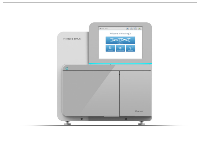
Figure 1: The NextSeq 550Dx Instrument

Leveraging sequencing by synthesis (SBS) chemistry and user-friendly, regulated workflows, the NextSeq 550Dx Instrument delivers high-quality results for clinical and research applications.