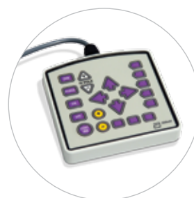
OPTIONAL INTUITIVE REMOTE

The ELLIPS ® FX Phaco Handpiece is utilized during the phacoemulsification procedure to break up (emulsify) the nucleus of the cataractous lens and remove the remaining nuclear fragments. The ELLIPS ® FX Phaco Handpiece is designed as a reusable product and is supplied nonsterile. Caution: Federal (USA) law restricts this device to sale by or on the order of a physician.